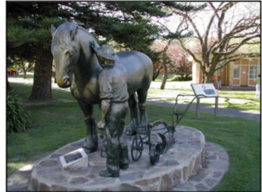
Angaston Agricultural Bureau Centenary Sculpture 'Day Off, Peter'

Agricultural Bureau of South Australia Inc. PATHWAY TO IMPROVEMENT