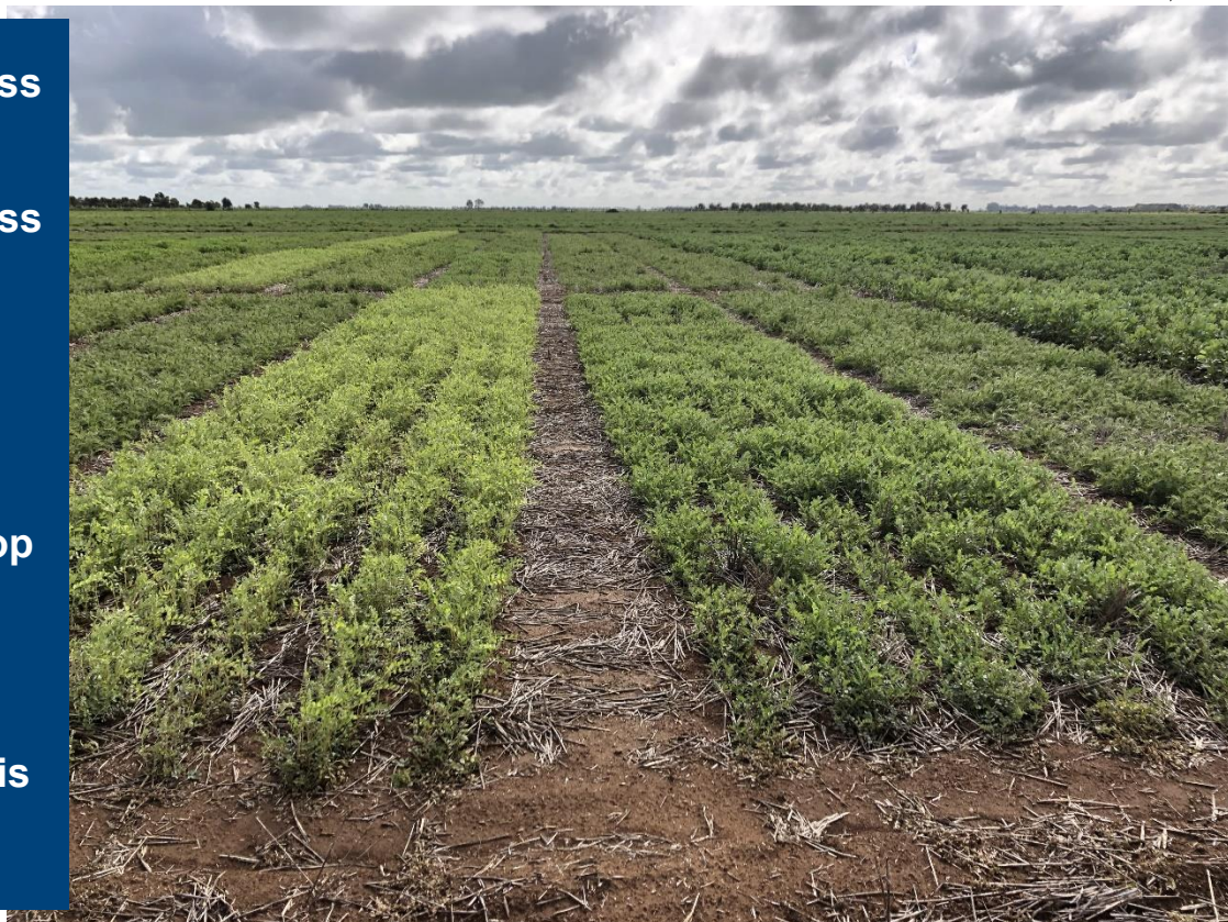
Figure 1: GA treated Morava left, untreated right