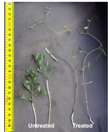
Figure 3: Effect of GA on early growth and vigour.

Economic analysis estimated the cost of GA at $8-9 per hectare plus application costs. While GA effects on vetch are inconsistent and therefore, unlikely to deliver a reliable economic benefit for vetch production.